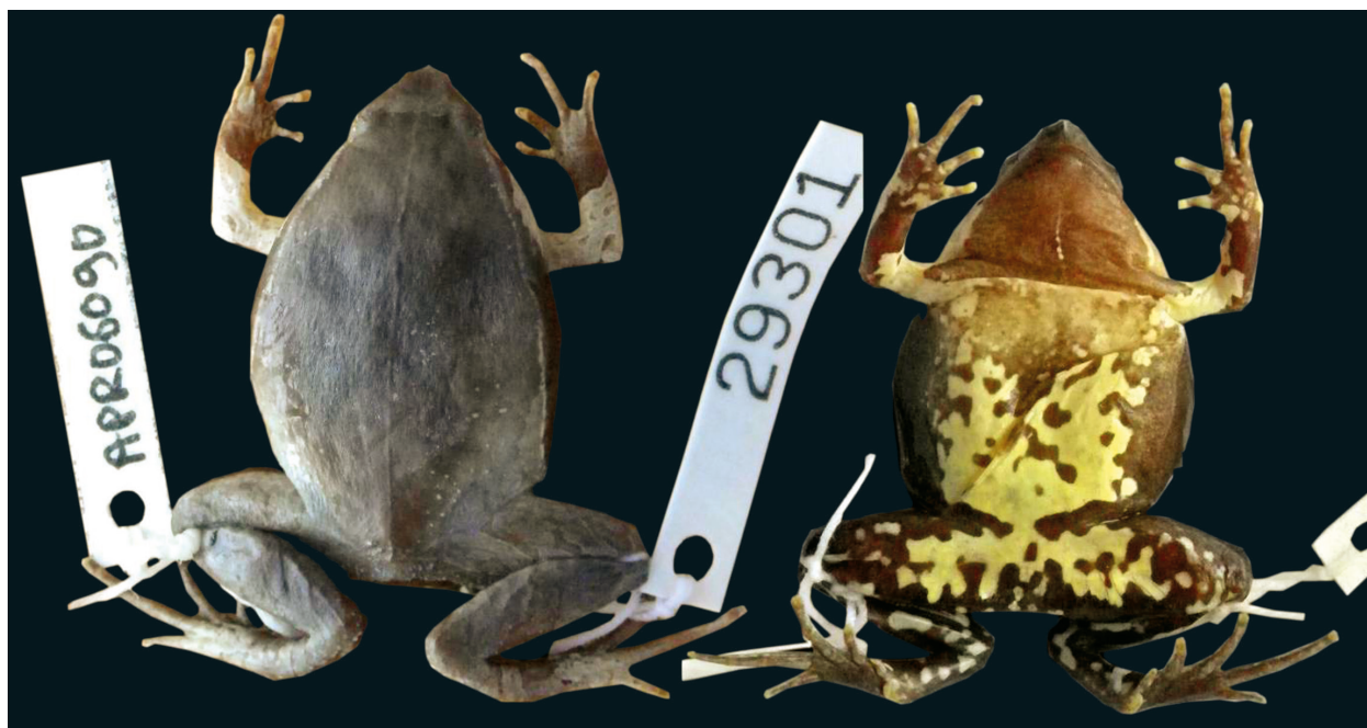
Fig. 2. Preserved holotype of Scaphiophryne matsoko (UADBA 29301) in dorsal and ventral views.

vocal sac. The left side of the head of UMMZ 211519 is damaged so that a number of measurements could not be taken, and additionally transversal and longitudinal ventral cuts were made in this specimen to examine gonads and shoulder girdle. The tibiotarsal articulation reaches the eye. As far as recognizable, also the coloration agrees with that of the holotype (after several years preserved in alcohol): brown ground color, light posterior head sides and tympanic region, distinct brown-white marbling on belly. The two MRSN paratypes are juvenile specimens in mediocre state of preservation, being in ethanol since 15 years. The tibiotarsal articulation of MRSN A2270 reaches the eye. The overall coloration is rather darkened, but it appears substantially similar to the adults, with a blackish mottled belly. MRSN A1849 is comparatively smaller, with a less dehydrated body. The tibiotarsal articulation reaches the eye. In this specimen whitish light spots (in life almost greenish-yellowish) are visible at the level of the fore-arm insertion. The right foot is amputated, with tarsus and metatarsus, but without any visible toe.