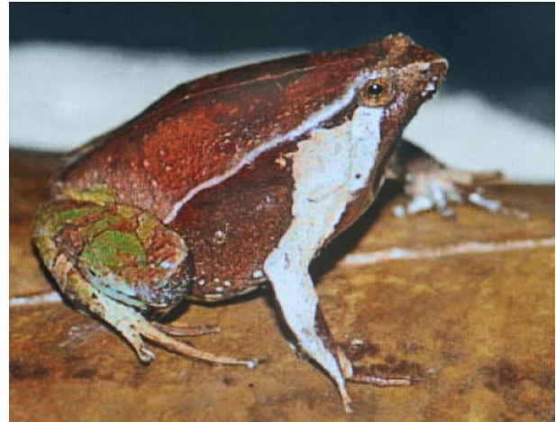
Fig. 1. Living holotype of Scaphiophryne matsoko (UADBA 29301) from Marotondrano in dorsolateral view.

Description of the holotype. Specimen in good state of preservation. For measurements see Table 1. A longitudinal cut along both flanks applied for gonad examination. Body stout; head slightly wider than long, distinctly narrower than body; snout tip pointed in dorsal and lateral views, with a distinct rostral projection beyond mouth opening ca. 2 mm in length. Nostrils directed laterally; slightly protuberant, nearer to tip of snout than to eye; canthus rostralis distinct; loreal region flat; tympanum not clearly visible; supratympanic fold visible, straight; tongue ovoid and broad, posteriorly free and not bifid; maxillary teeth not recognizable; vomerine teeth absent; choanae rounded. Forelimbs slender; subarticular tubercles single and distinct; metacarpal tubercles not recognizable; fingers without webbing; relative length of fingers 1 < 2 < 4 < 3 , fourth finger clearly longer than second finger; finger disks not expanded; nuptial pads absent. Hindlimbs relatively slender and short but longer than in most other Scaphiophryne ; tibiotarsal articulation almost reaches the tympanal region when hindlimb is adpressed along the body; lateral metatarsalia strongly connected; large and sharp inner metatarsal tubercle present, no outer metatarsal tubercle; no tarsal tubercle; traces of webbing between toes; relative length of toes 1 < 2 < 5 < 3 < 4 ;